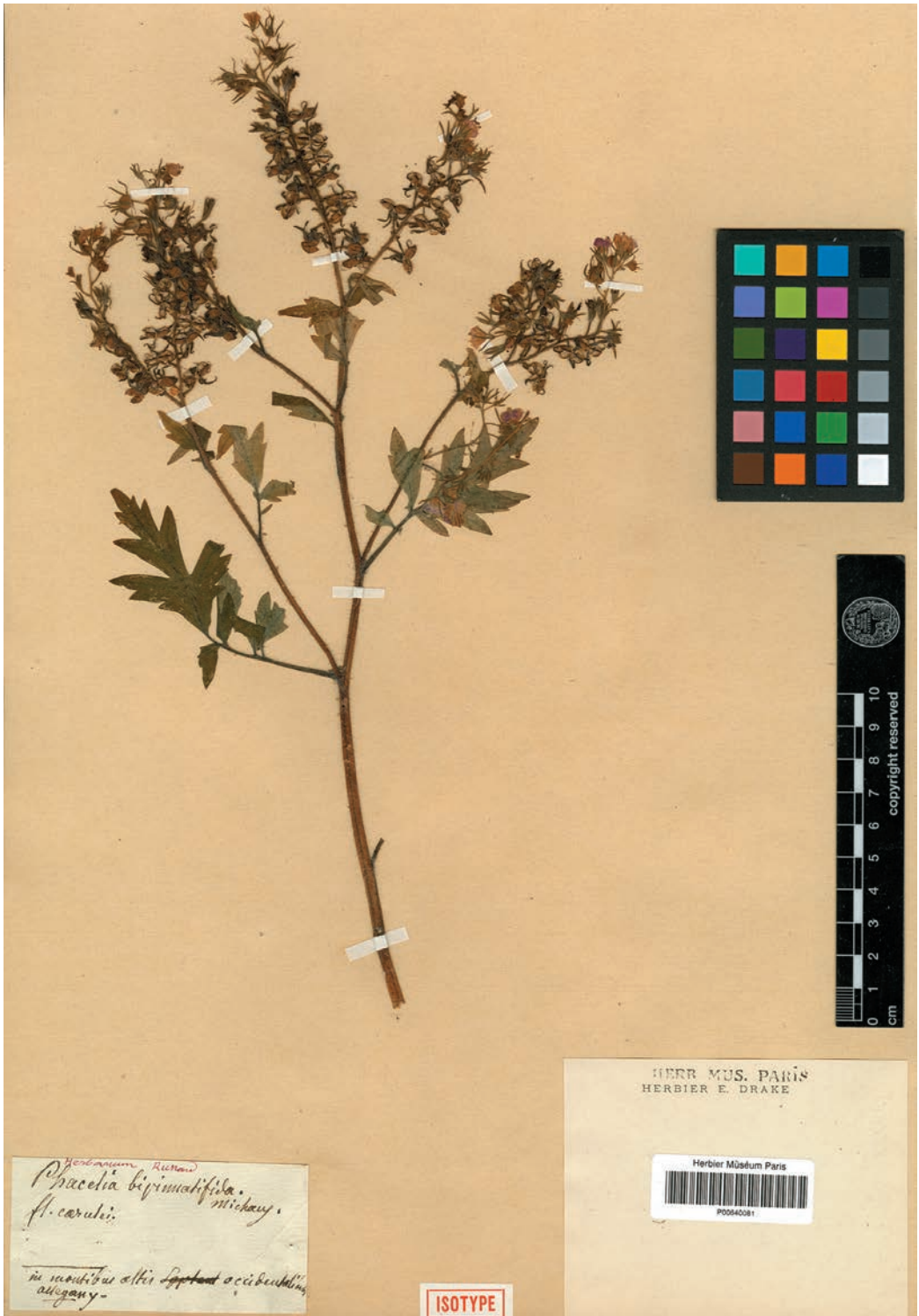
Supplemental Figure 2. Image of the Phacelia bipinnatifida isotype (MNHN-P-P00640081) provided by the Muséum National D'Histoire Naturelle Paris (PCU).